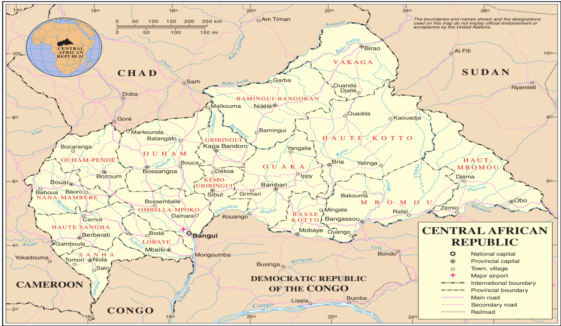
Annex: Map of Central African Republic