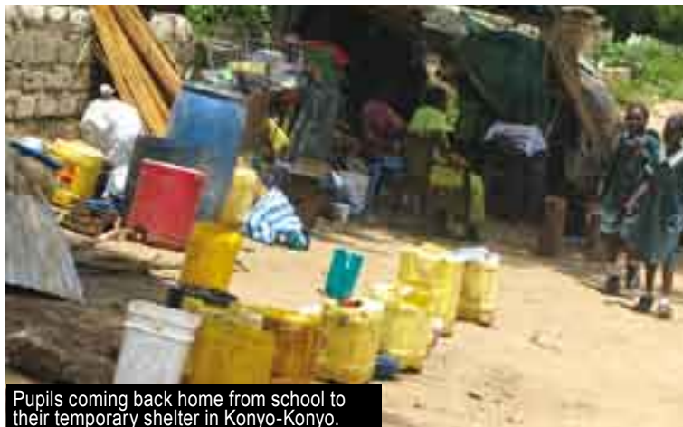
Pupils coming back home from school to their temporary shelter in Konyo-Konyo.

"Before the demolition, we used to have breakfast and two meals a day," he added. "But now there is a total lack of everything (and) we only eat once a day. We have been brought to a total fiasco." ■