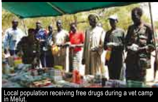
Local population receiving free drugs during a vet camp in Melut.