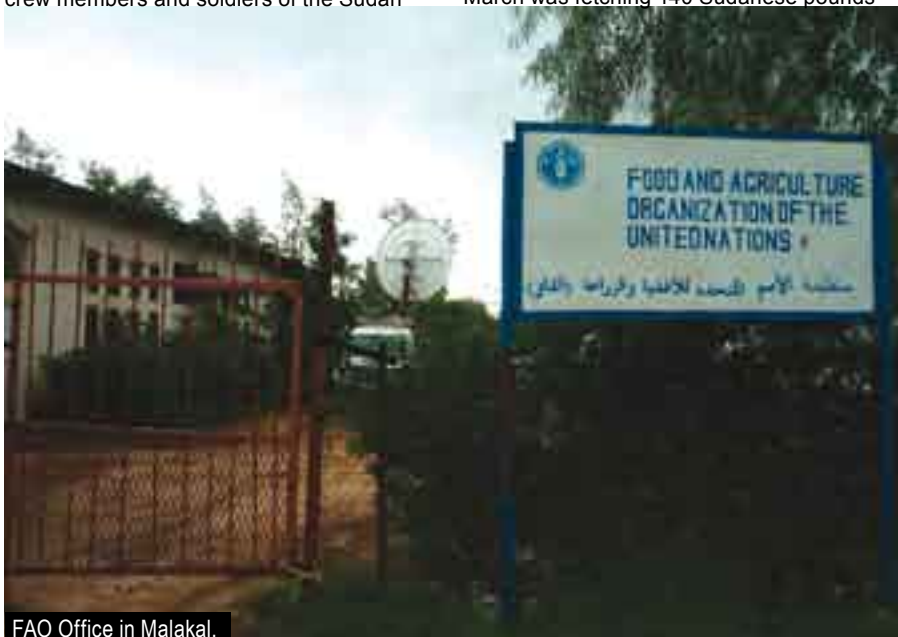
FAO Office in Malakal.