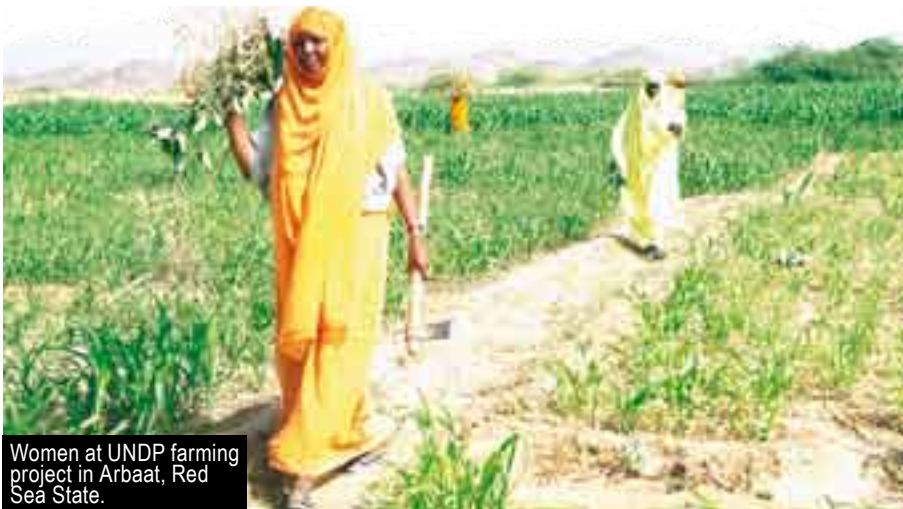
Women at UNDP farming project in Arbaat, Red Sea State.

Little did she know that the training would give the 35-