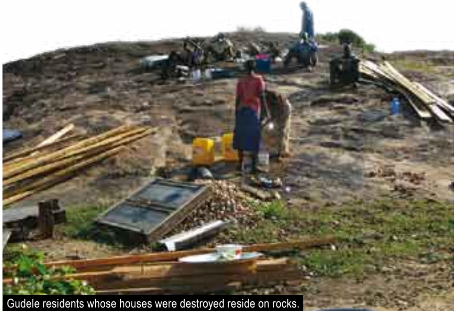
Gudele residents whose houses were destroyed reside on rocks.

"Why does the government decide to destroy our families up here in the hills of Gudele