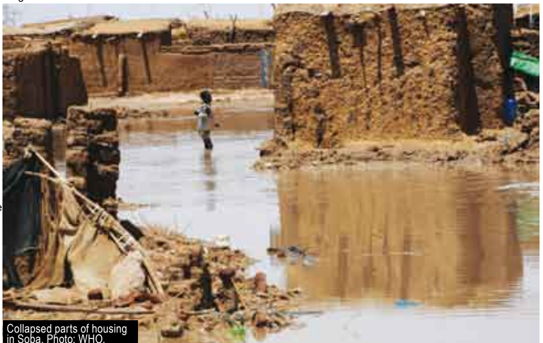
Collapsed parts of housing in Soba.