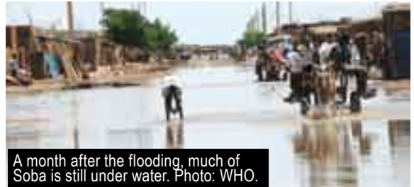
A month after the flooding, much of Soba is still under water.