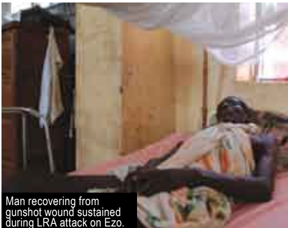
Man recovering from gunshot wound sustained during LRA attack on Ezo.