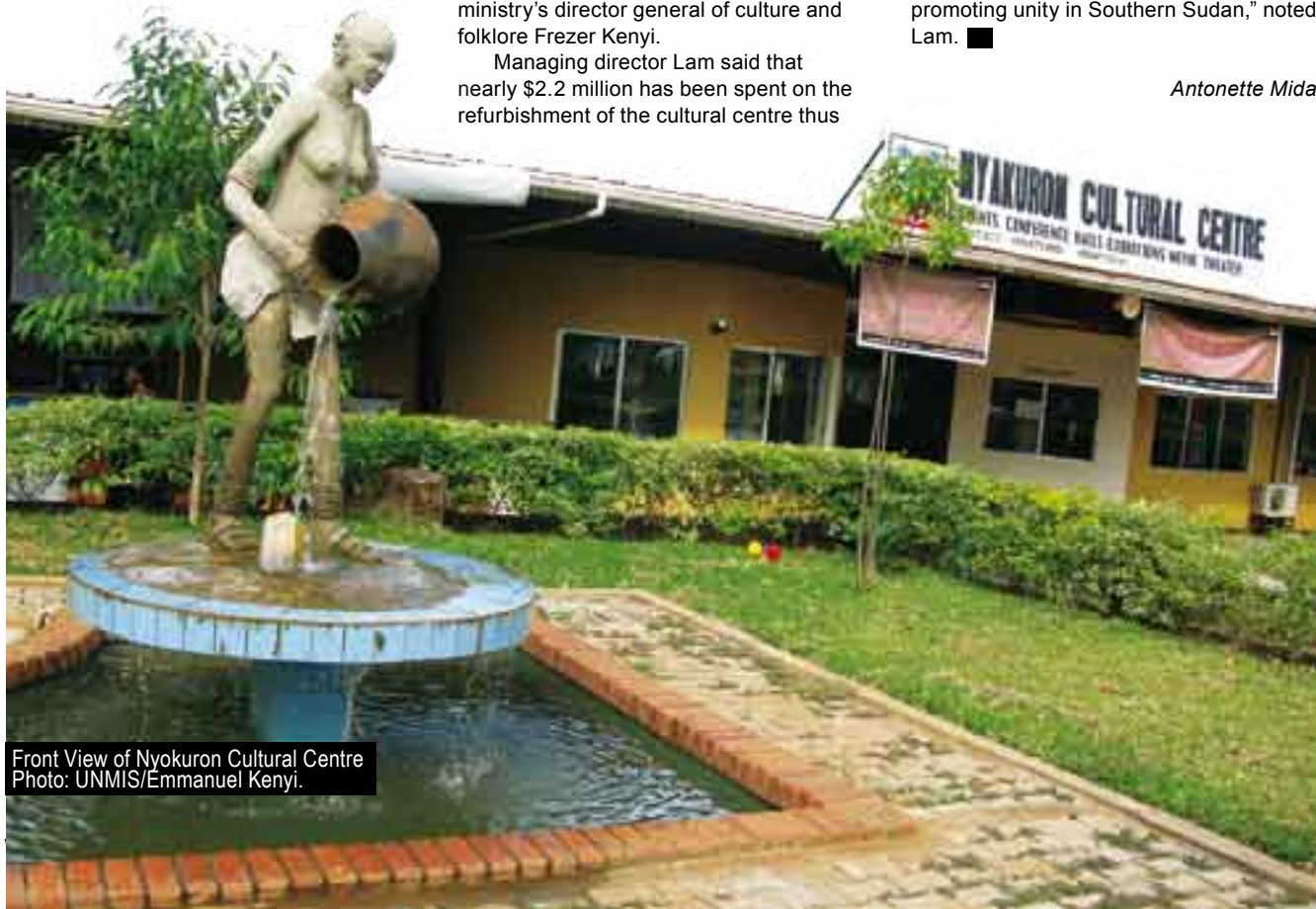
Front View of Nyakuron Cultural Centre