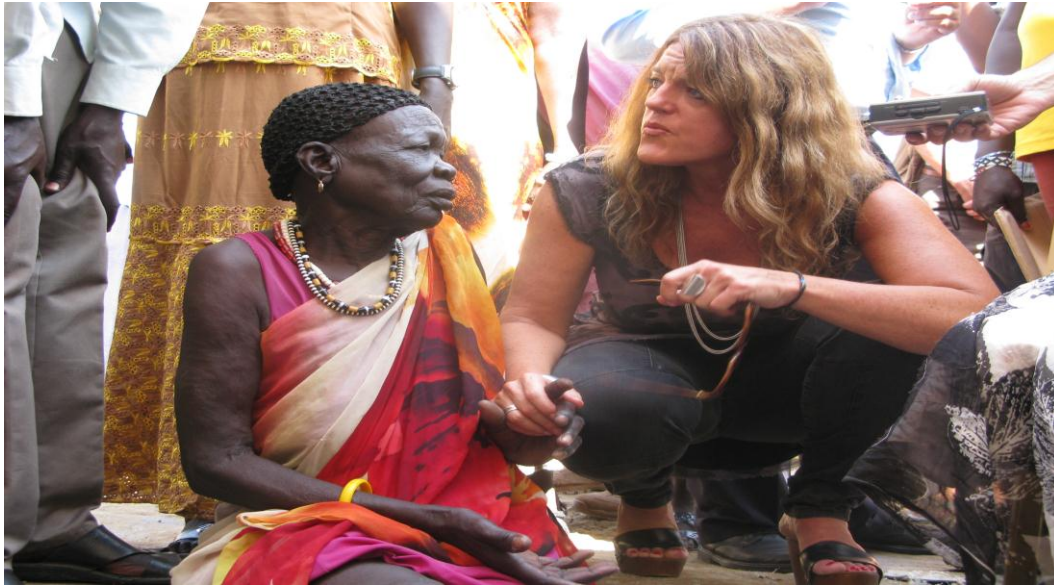
The SRSG having a chat with an elderly woman at the Protection of Civilians Site Clinic in Bor.